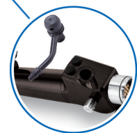
Detachable Suction Valve (Olympus Standard)