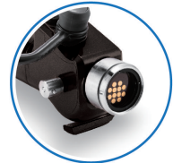
High Quality Video Connectors