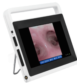
10" High-Definition Screen