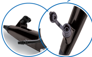
Instrument Channel (Olympus Standard)